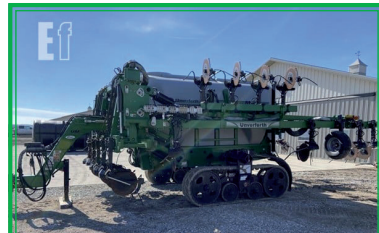
Unverferth Nutrimax 2600 60' 23 row side dress machine Has 2,000 acres on new coulters and knives Added Y drops