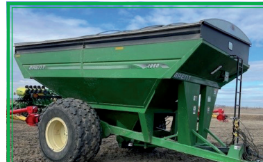
Brent 1080 SN B21960152 Roll tarp Back up camera 35.5x32 Firestone diamond tread tires