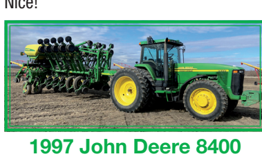
1997 John Deere 8400 SN RW8400P011843, MFWD, 380/85R34 Fronts, 480/80R46 Duals, 4 Hydraulics, Aux hyd connections, 3 point with quick hitch, 1000 RPM PTO, Powershift, Auto Trac Ready, Shows 8870 hours