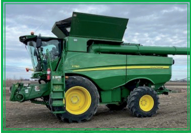
2019 John Deere S780 SN1H0S780SKKT806584, 4WD, 1100/848 hours, 1250/35R46 LSW, power fold bin ext, premium cab w/ leather, high wear package, 28' auger