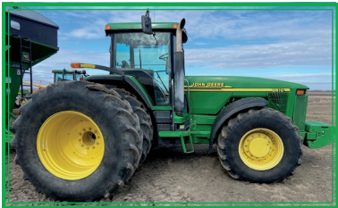
2001 John Deere 8410 SN RW8410P014894, 710/70R 38 Rear Duals, 600/65R28 Fronts, 5 Hydraulics, 3 Point with quick hitch, 1000 RPM PTO, Rear 1500 lb weights, Powershift, Shows 6113 hours