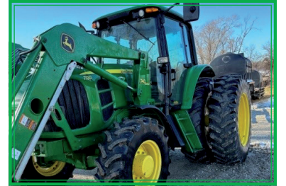
2008 John Deere 7130 SN L07130H562151, MFWD, JD 740 Classic Loader, Joystick, 3240 Hours, Power Quad w/ LHR, 18.4R38 Duals