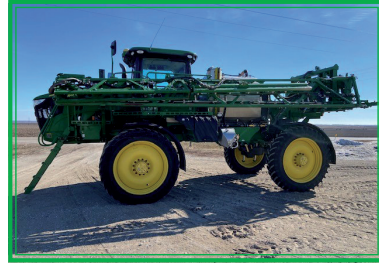
2014 John Deere R4038 SN 1N04038RJE0006559, 380/90R46 Rubber, 1000 gal SS tank, 100' boom, 2432 hours, JD 2630 screen with AT SF2 and Section Control