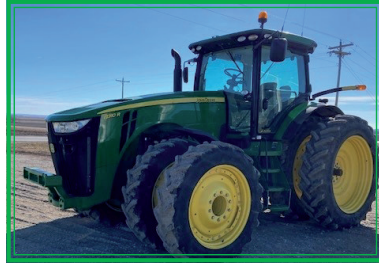
2012 John Deere 8310R SN 1RW8310RTCP061846, 2880 hours, 480/80R50 rear duals, 1000 lb rear inside wts, 380/80R30 front duals, Powershift, ILS front end, foot throttle. Nice!