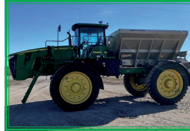
2012 John Deere 4940 SN 1N04940XTC0023344, 380/105R50 Rubber, New Leader L3030G4 dry box, 2475 hours, 2630 screen w/ Auto Trac SF2